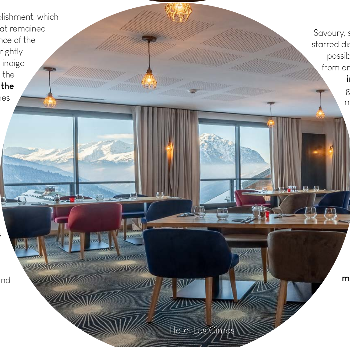
Hotel Les Cimes

..... +33 (0)6 73 72 39 21 – bergeriedupays@yahoo.com ☎