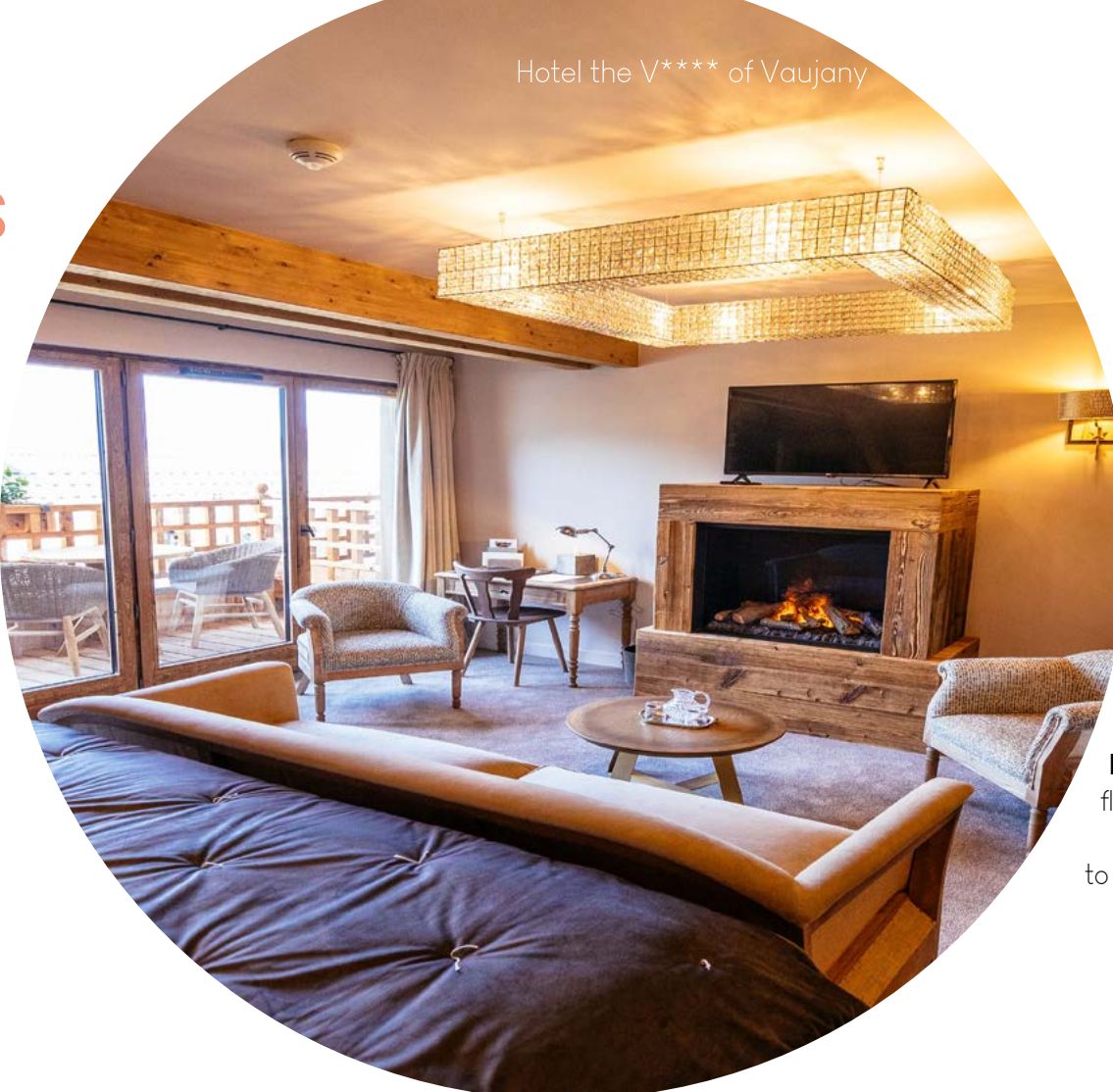
Hotel the V**** of Vaujany

..... € Nights starting from 150 €. ☎ laurentberard@orange.fr